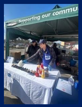
Pictured are staff and participants at the WATCH Bunnings BBQ in July this year.