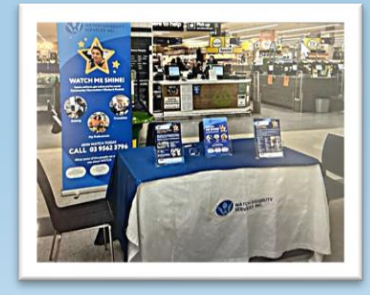
Pictured above is the WATCH marketing stand that was held at Waverley Gardens Shopping Centre in July.